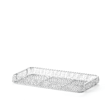
DIN Basket with handles