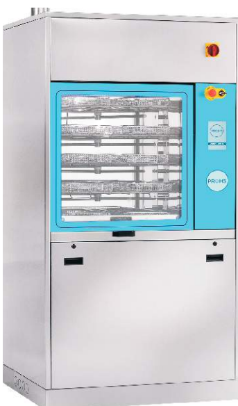
Dim. (WxDxH mm): 1000x900x1900