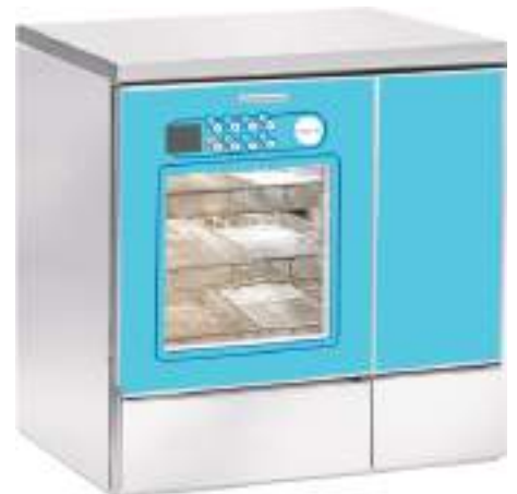
PROHS WD-8L-SC PROHS WD-8L