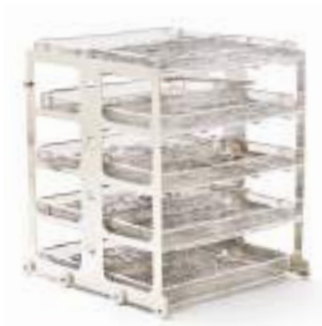
5 Levels washing trolley