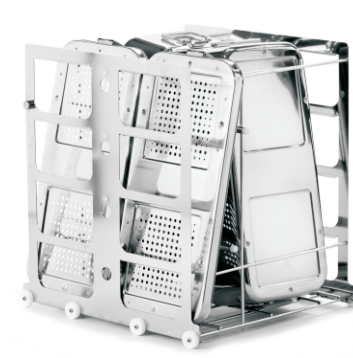
Trolley for container washing