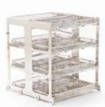
4 Levels washing trolley