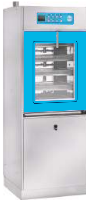
Dim. (WxDxH mm): 650x700x1850