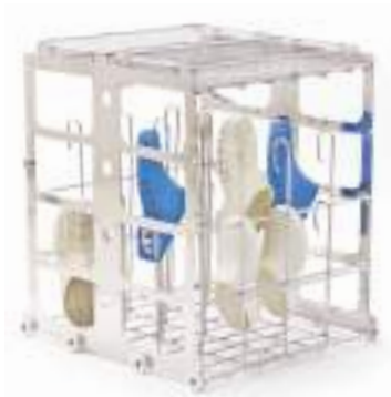
Shoes washer support structure