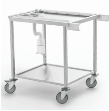
Load / unload trolley