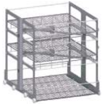
Glass washer trolley