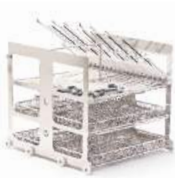
Mini invasive and tubular Surgery washer trolley