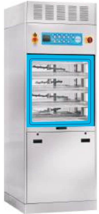
Dim. (WxDxH mm): 680x700x2300