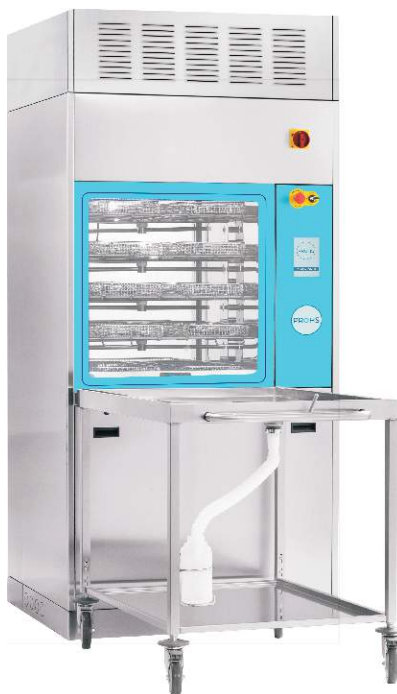
Dim. (WxDxH mm): 1000x900x2300