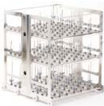
Laboratory washer trolley Total levels with injector