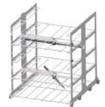
Baby bottles trolley